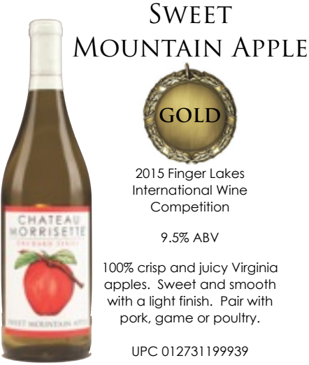
2015 Finger Lakes International Wine Competition